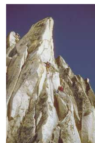
Mountaineering - Sid Scull Bugaboo Gendarme