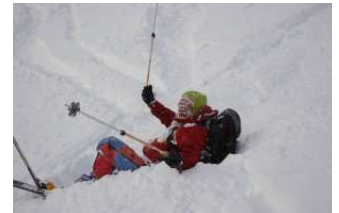
Another tele skier is converted. OK Not Quite.