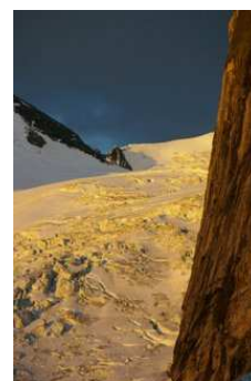
Landscape - Cat Mather Somewhere in the Bugs