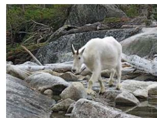
Flora and Fauna - Sid Scull Mountain Goat North Cascades