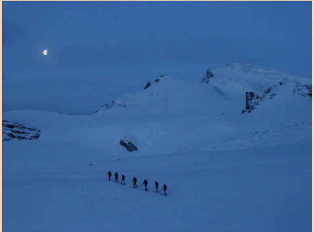
Alpine Start, Strahlhorn, Haute Route