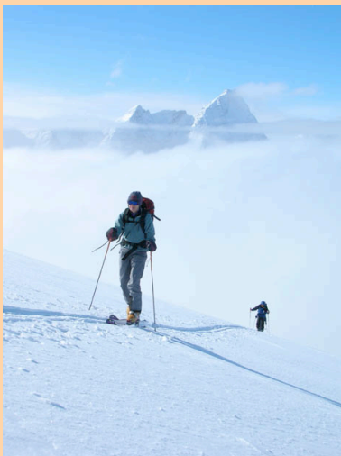
Mt Sir Donald from Copperstain Mt