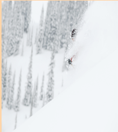
Unpacked Powder – Campbell Icefields