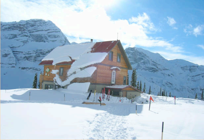
Campbell Icefield Chalet sheds its load Mar 2007